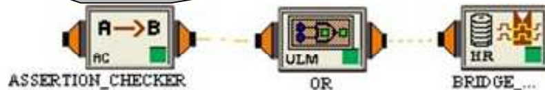
Figure 2: Assertions set up as trace triggers.